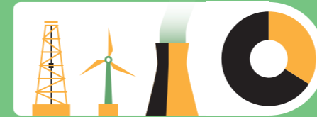
In 2010, buildings accounted for 32% of global final energy use.