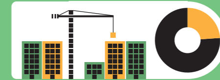
In 2010, buildings accounted for 19% of all GHG emissions.