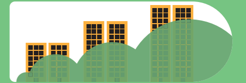
CO 2 emissions in the building sector could double or triple by 2050.